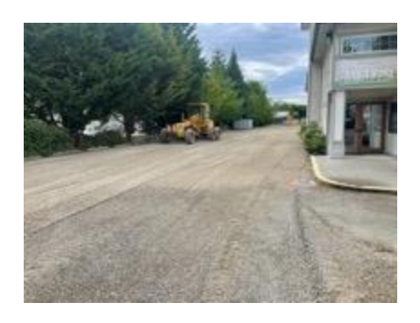
Parking lot regrading in progress