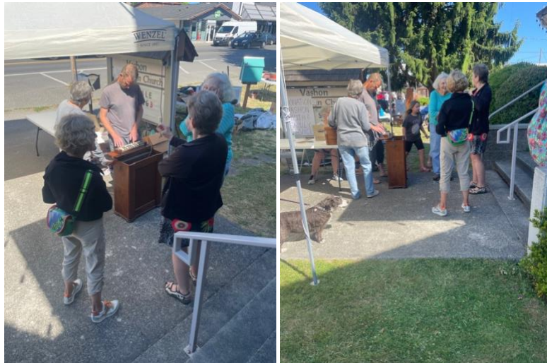
Yard Sale Activities