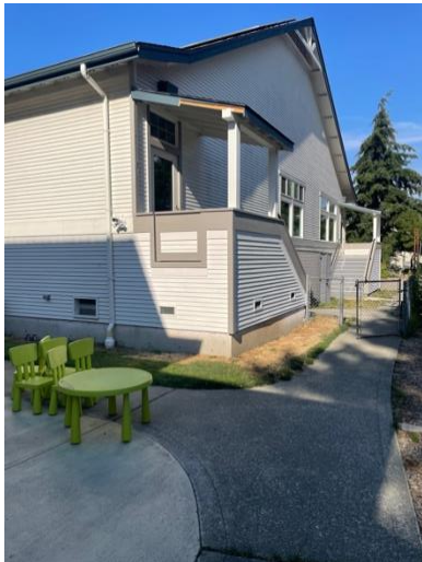
New Back Porch