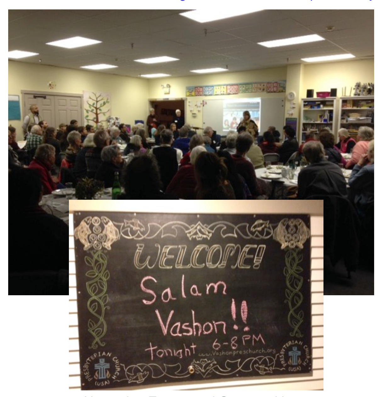
Upcoming Events and Opportunities

We are so grateful for the outpouring of support and the strong interest in being involved that <u>YOU</u>, our community, extended on November 18<sup>th</sup>. Over 130 people attended Salam, Vashon and we raised over $2600! Additionally, the success of the event fulfilled our goals in a number of important ways.